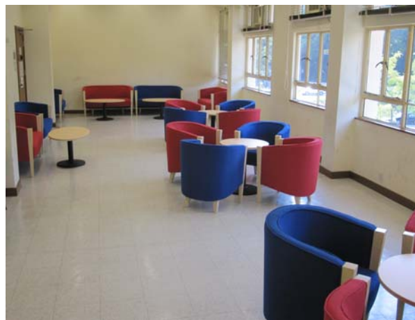
Student Common Room at Room 208-210 John Fulton Centre