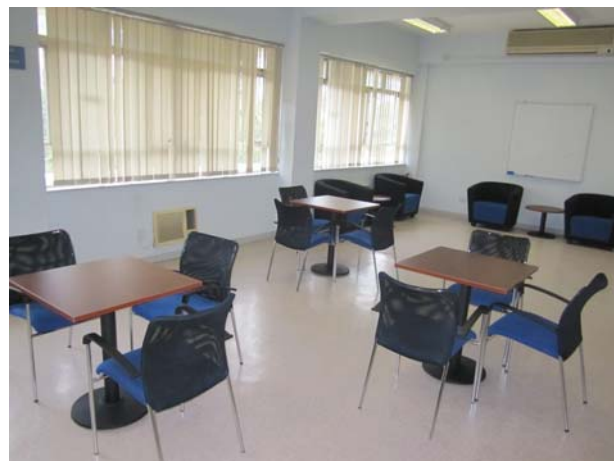
Student Activity Room at Room 306 Benjamin Franklin Centre

The Student Common Room at Room 208-210, John Fulton Centre and the Student Activity Room at Room 306, Benjamin Franklin Centre have been refurbished and in operation since August this year. These rooms open from 9:00am to 11:00pm for use by the CUHK student community. For the Student Activity Room at Benjamin Franklin Centre, all registered student bodies can also make reservation for student functions via the Online Booking System managed by the Office of Student Affairs at https://osanta.osa.cuhk.edu.hk/booksys/login.asp?which_page=6 .